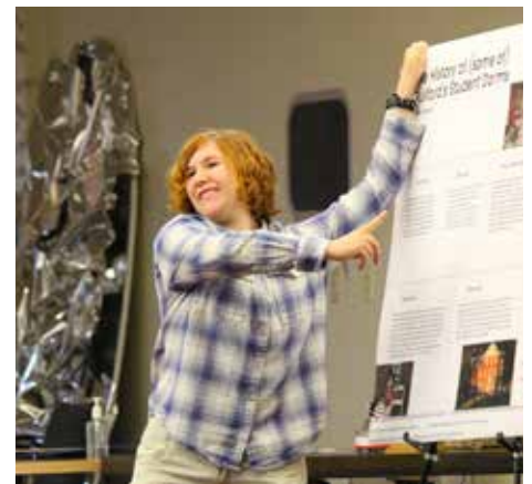
Guilford Undergraduate Symposium

And we partnered with Cornell University to hold a summit in Washington to forge more U.S and African higher ed partnerships .