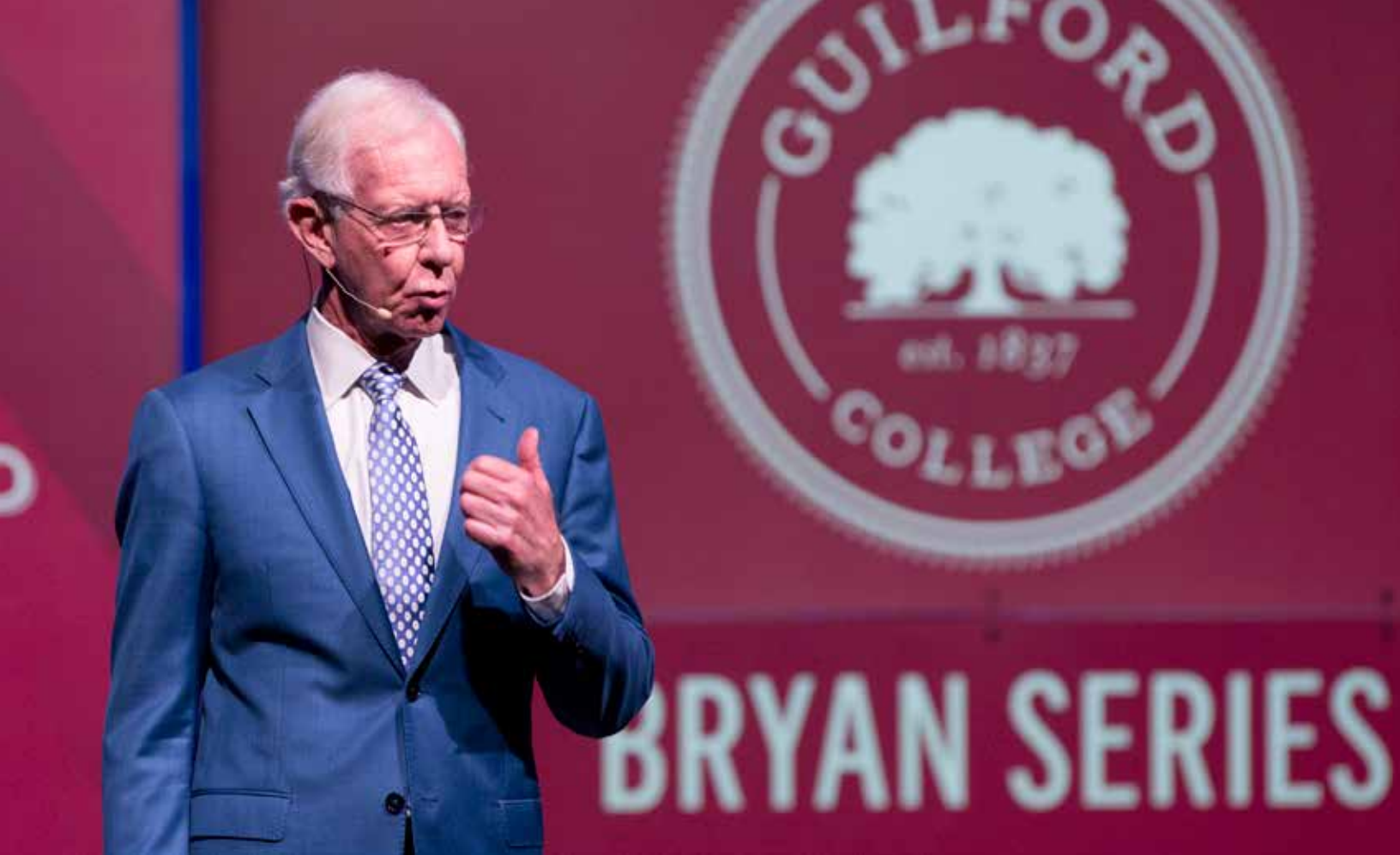
Sully Sullenberger at the Bryan Series in September