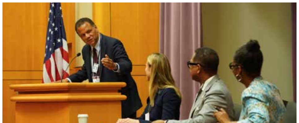
The University Partnership Summit