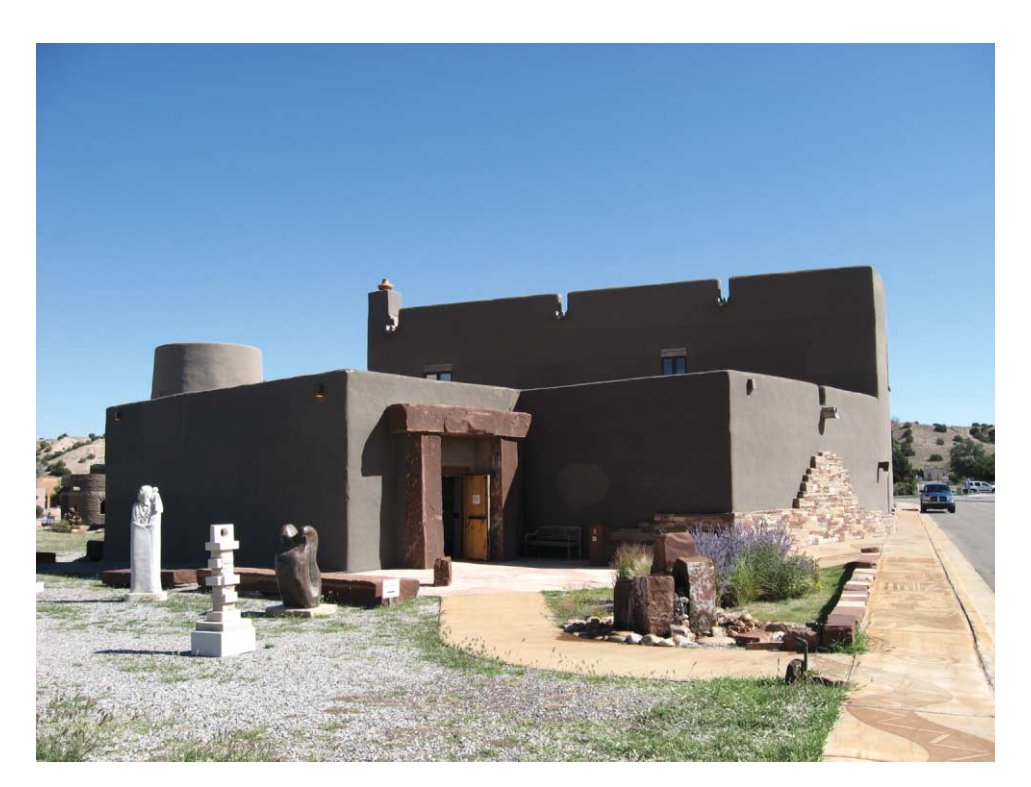
Figure 5. The Poeh Museum.

Upon entering the Poeh Museum, which opened in 2005, visitors receive headsets with an audio guide to the main exhibit, Nah Poeh Meng (Our Continuing Path). The commentary features a narrator and the voices of named individuals from Pojoaque and surrounding Pueblos telling stories and interpreting Tewa culture and history. In the hallway outside of the exhibit, the narrator greets visitors in Tewa, then explains 'Poeh means path, and this museum is an interpretation of the path that our people have travelled to get to this point in our cultural history'. A single path winds through