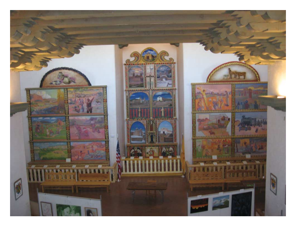
Figure 3. Reredos inside the Misión.

However, if the Misión-Convento secularises religion, it simultaneously sacralises history by placing paintings of churches and historical scenes within a religious