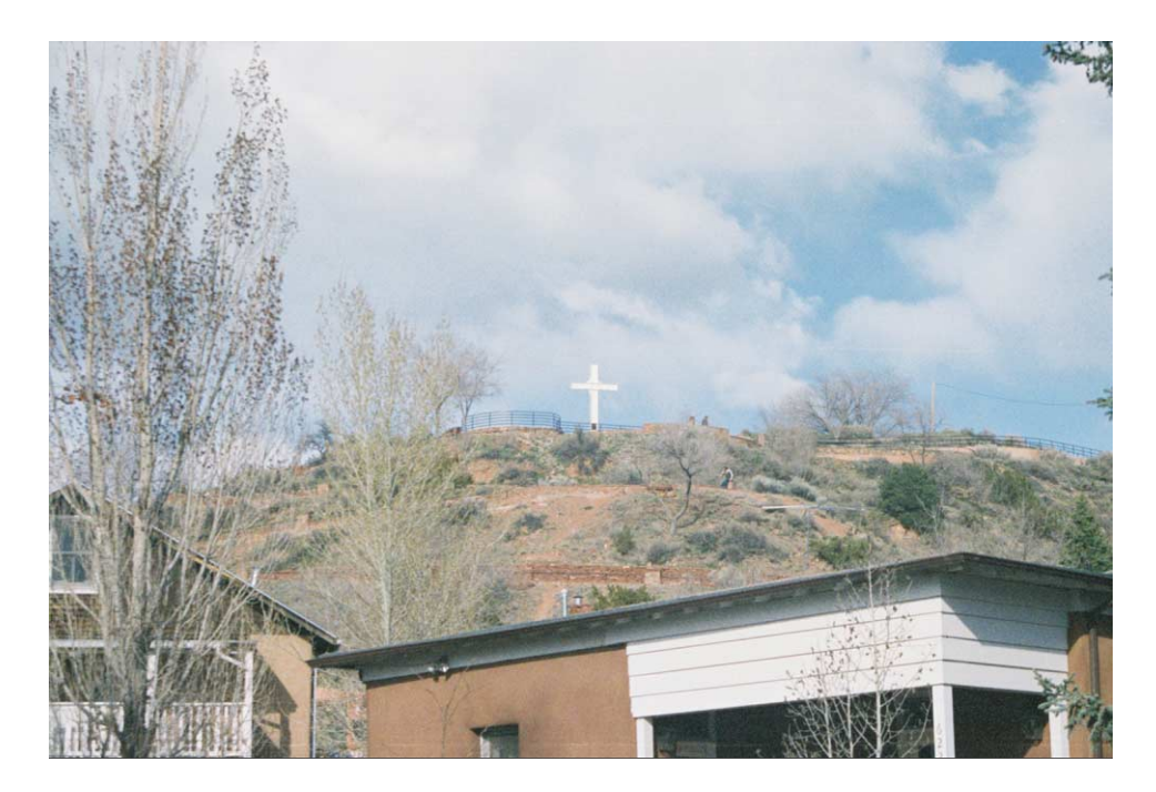
Figure 1. The Cross of the Martyrs, with commemorative walkway visible winding up hill.